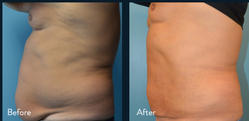
Laurence Kirwan, MD

Safe, gentle and effective minimally invasive procedure for body contouring. One procedure. Significant, long-lasting results.